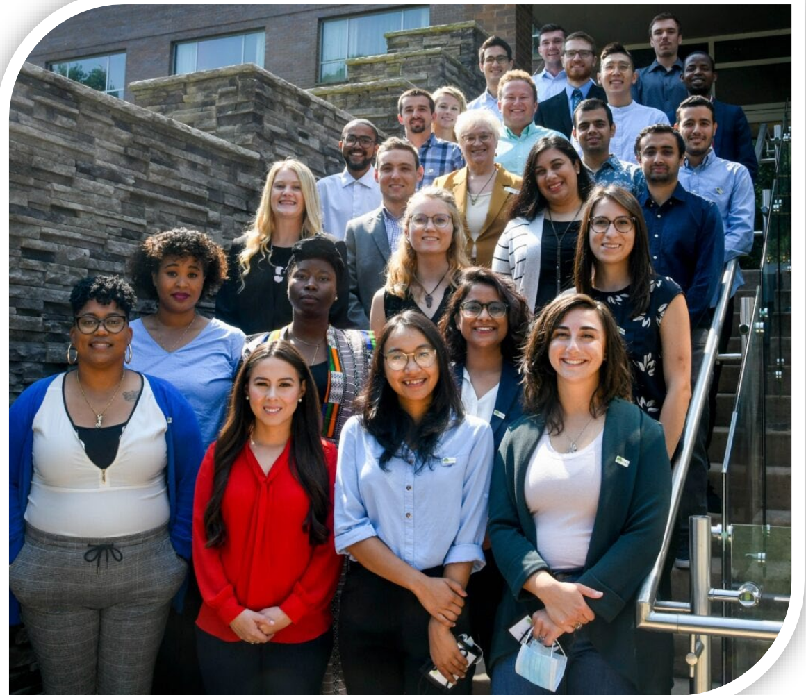
The 2021-2024 Rocky FFAR Fellows