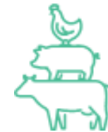
Advanced Animal Systems