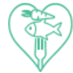
Health Agriculture Nexus