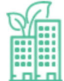
Urban Food Systems