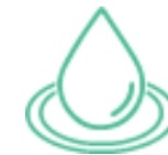
Sustainable Water Management